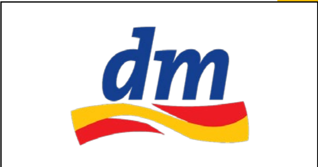
19/a Besenyő Street (16 minutes from the dormitory)