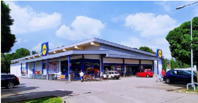
LIDL 12 Bánfalvi Road