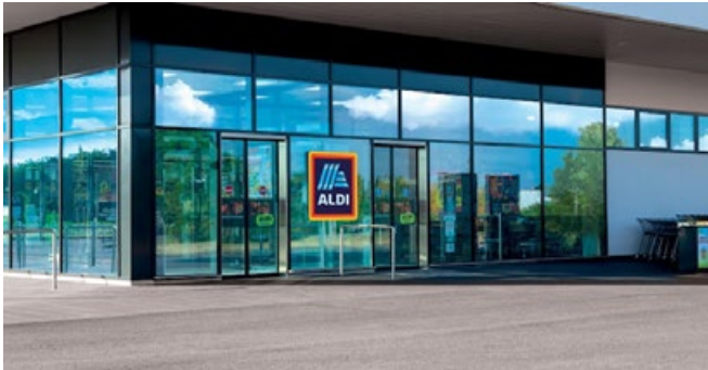
ALDI 4/A Ágfalvi Road