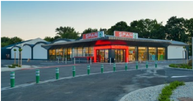
SPAR 8 Bánfalvi Road